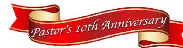
Laura not pictured