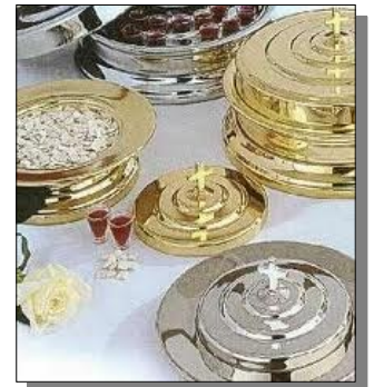
Ordinance of Lord's Supper

Following the service everyone is invited to a fellowship meal in the Fellowship Hall. Please bring a veggie dish and a salad or dessert and enjoy the food and fellowship.