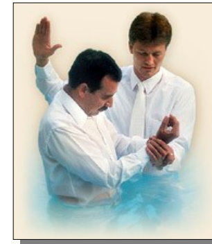
Ordinance of Baptism