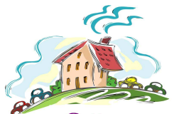
Cottage Prayer Meeting

Call the church office and let us know if you will be attending.