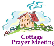
Cottage Prayer Meeting

Begins this Sunday 5 p.m. in the Welcome Class 6 weeks on prophecy . All ladies are invited.