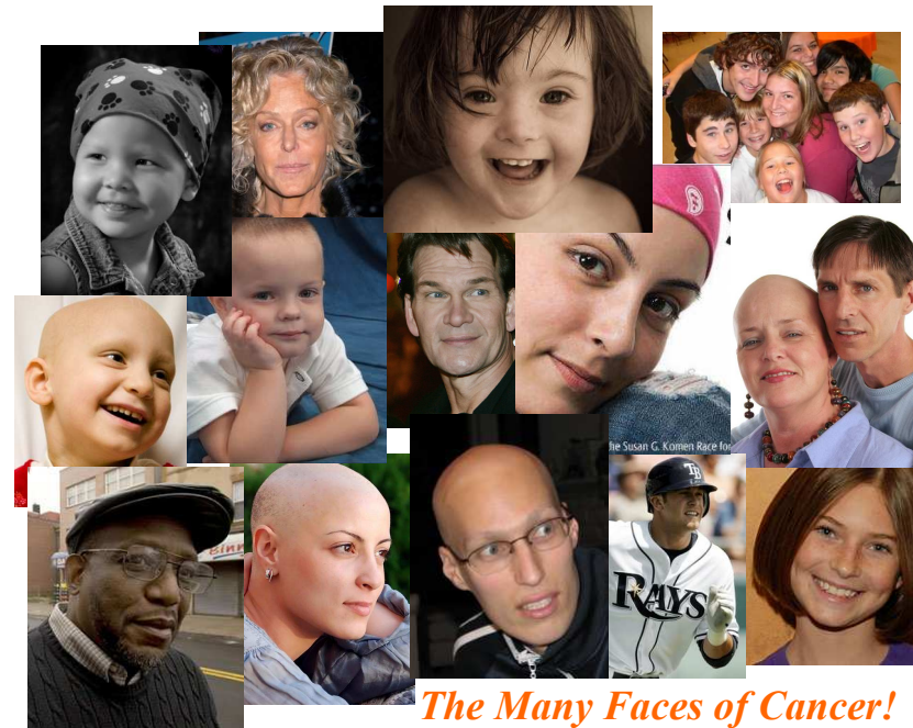
The Many Faces of Cancer!

This Sunday we will have a special time of prayer for cancer patients, their families and caregivers. We will also recognize those among us who have survived the disease and those who work in the field of oncology. Wear pink!