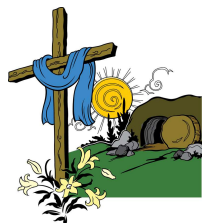
Sunrise Service 7:00 a.m.

Mondays @ 6 p.m. in the Fellowship Hall.