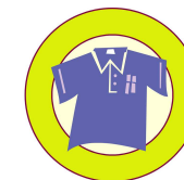
NORTHGATE SHIRTS ON SALE

Orders are being taken for golf shirts with Northgate Baptist Church embroidered on them. The cost is $40 for Ping and $50 for Cutter and Buck shirts. Order forms are available at the church, but you must turn the order in to Dean Waters, and you must prepay for your order. Shirts are displayed in the office window. This is a fund raiser to help with the youth mission trip to Greece this summer.